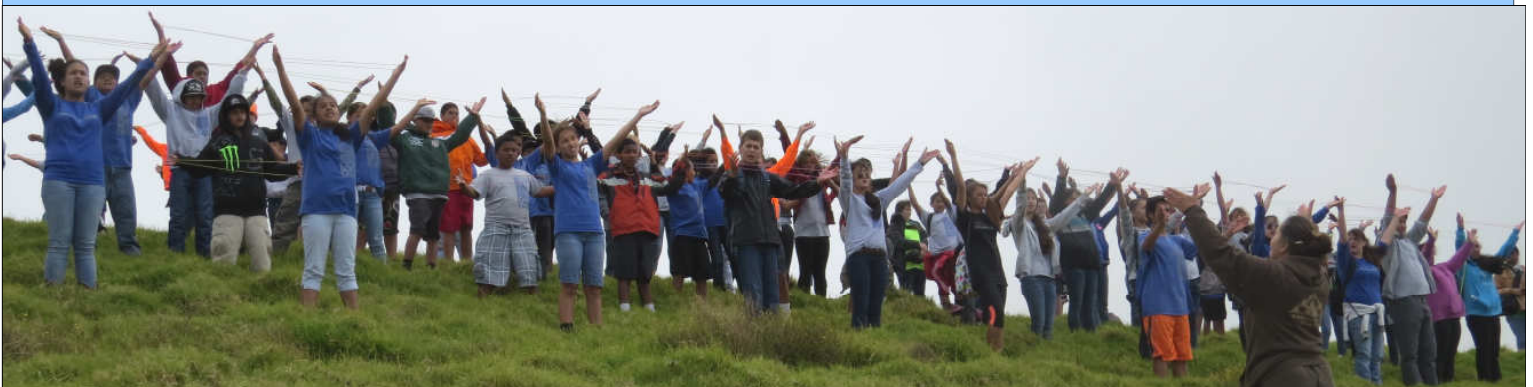
To see more, go to www.Facebook.com/WaimeaMiddleSchool