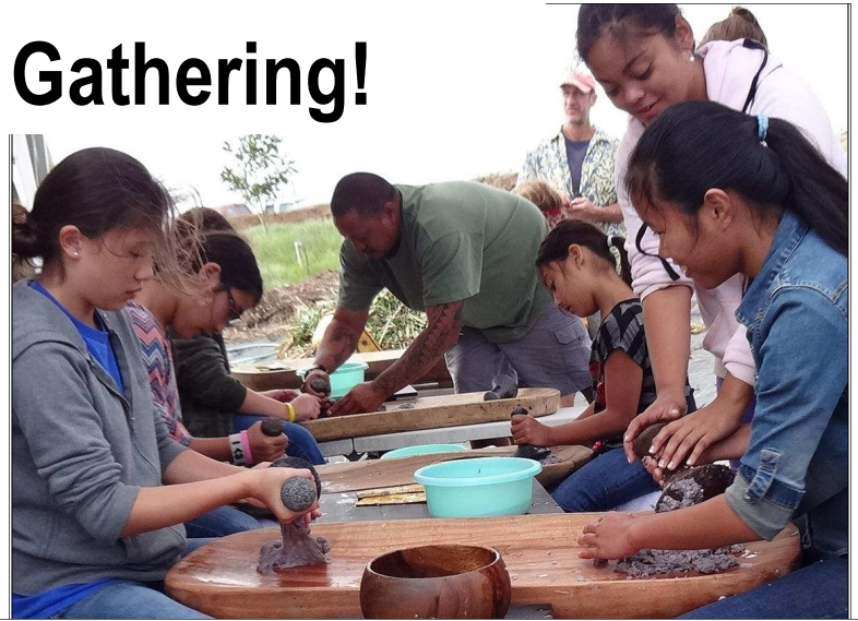
This Thursday's Fest will again let students learn to pound kalo.

Stone Soup is something of a WMS tradition. Back in 2009 when the DOE and Gov. Linda Lingle decided to furlough students, WMS refused to do so. The school's faculty and staff, along with its local school board, Ho'okako'o Corp., with (Continued Page 4)